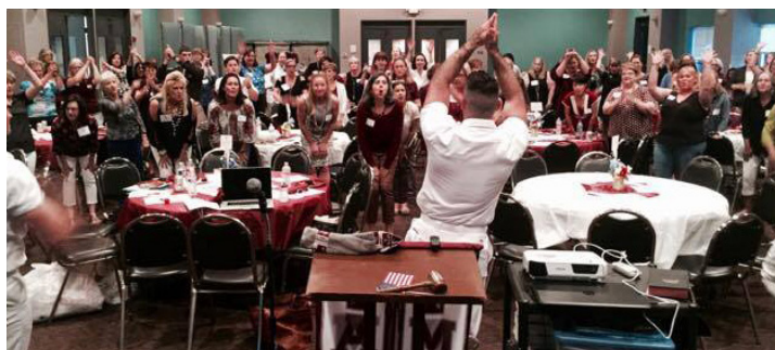
Left: Houston Aggie Moms Enjoyed Working on Yell Practice with the Galveston Yell Leaders